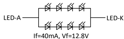
BACKLIGHT LED CIRCUIT DIAGRAM